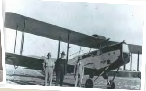
Rev John Flynn's dream of the Flying Doctor was achieved thanks to a Gift in a Will, which allowed him to lease his first aircraft.