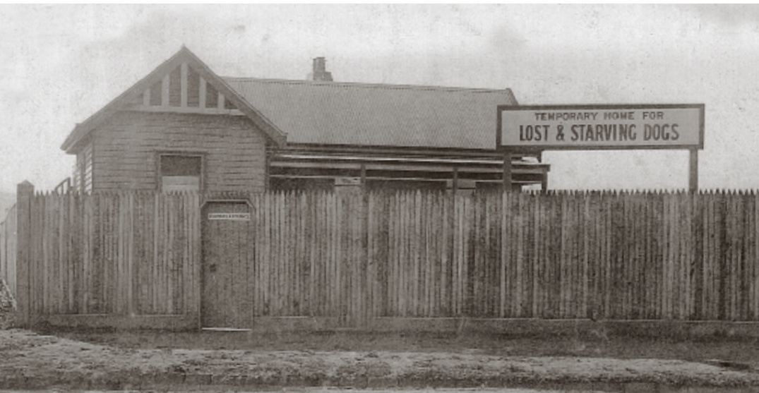
The Temporary Home for Lost and Starving Dogs in February 1913.

The idea to establish the Home began in 1910, when a concerned and influential group of individuals founded a committee to set about improving the welfare of lost and starving dogs. They actively opposed the local council's inhumane methods of poisoning and drowning stray dogs, and decided that more needed to be done to help the unwanted dogs of Melbourne.